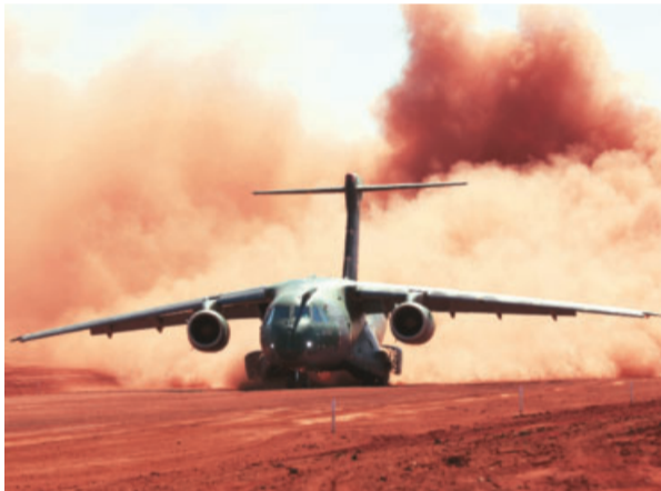
A file photograph of the C-390 Millennium medium transport aircraft operating off an unpaved runway

Embraer's C-390 Millennium MTA was first pressed into operational service in the Força Aérea Brasileira (FAB, or Brazilian Air Force) in 2019. The FAB flies 19 Millennium aircraft in its fleet. Besides these, the Portuguese Air Force flies five C-390 Millennium aircraft, Hungary